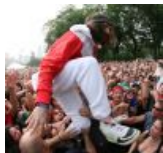
Lollapalooza 2008, August 1-3, Chicago