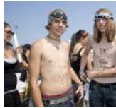
Warped Tour '08 in Long Island