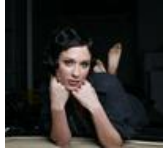
The Lovely Ladies of Zivity